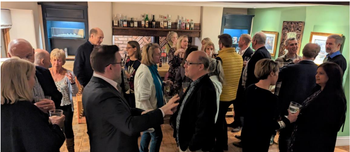
Pictures above are from the West Country Tourism Conference and the Industry dinner at Higher Wiscombe.