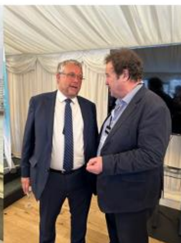
Steve Double MP