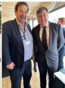
John Whittingdale MP