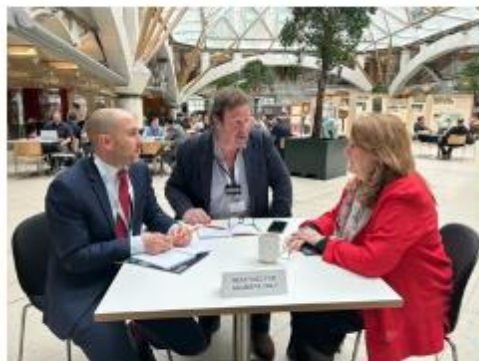
Sarah Dines MP