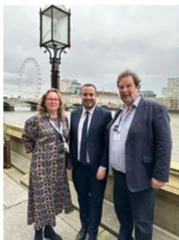
Simon Jupp MP